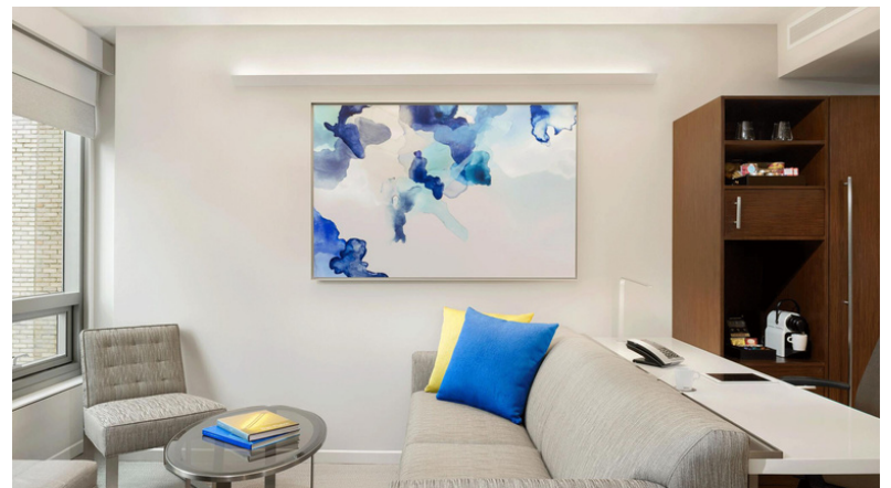
Vode Custom Wedge with ZipOne

LBC projects must demonstrate a reduction in energy performance. ALR can help you meet the baseline reduction requirement (35-70%) by calculating watts per square foot and choosing from the most efficient fixtures on the market.