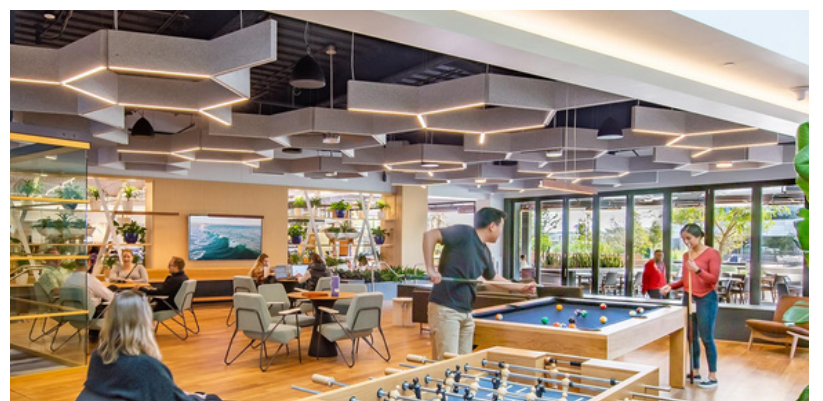
Focal Point Seem 1 Acoustic Trio